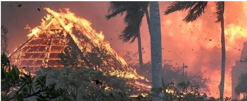
Wildfires sweep Hawaii