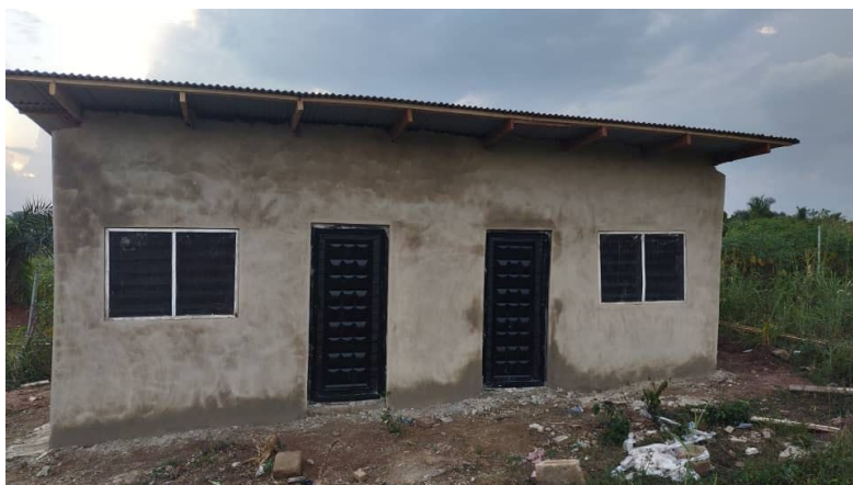
Recently built caretaker cottage

its rented space to a planned warehouse facility which will also eventually have vocational programs in carpentry, plumbing and electrical work.