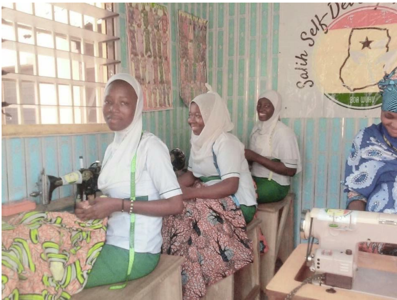
Young women learning sewing skills at the Salih Self-Development Center

The Salih Self-Development Center has been dedicated to providing adolescents and young adults from the Aboabo township of Kumasi, Ghana with vocational training in sewing since 2014. Twenty girls have been supported and have graduated from the Salih sewing program. With this vocational skill, the graduates have improved the quality of their lives. One of these graduates traveled to Cameroon, married, started her family and opened her own shop for tailoring.