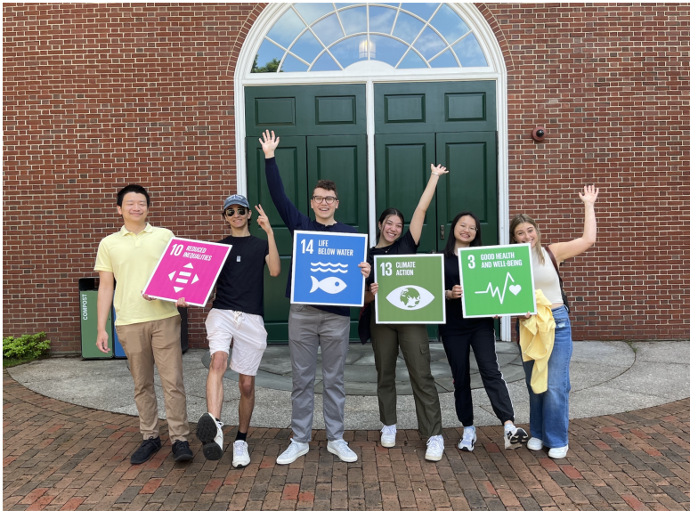
Summer interns on one of the final days of the Summer Institute in Global Leadership

ClassACT HR73 bridge United Nations Association of Greater Boston , participated in Harvard's Global Day of Service on September 1, 2023. They had eight Harvard undergraduate volunteers who provided posts on social-media sites and wrote 22 country profiles. The profiles will be used in their upcoming Greater Boston Model UN Conference at Suffolk Law School in early October and will support students engaging in the Model UN Conference focusing on the topic set forth by the UN's Human Rights Council to Model UNs around the world .