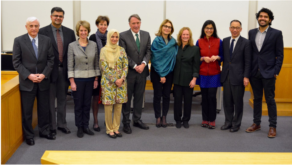
December 2016 Weatherhead Panelists and Participants